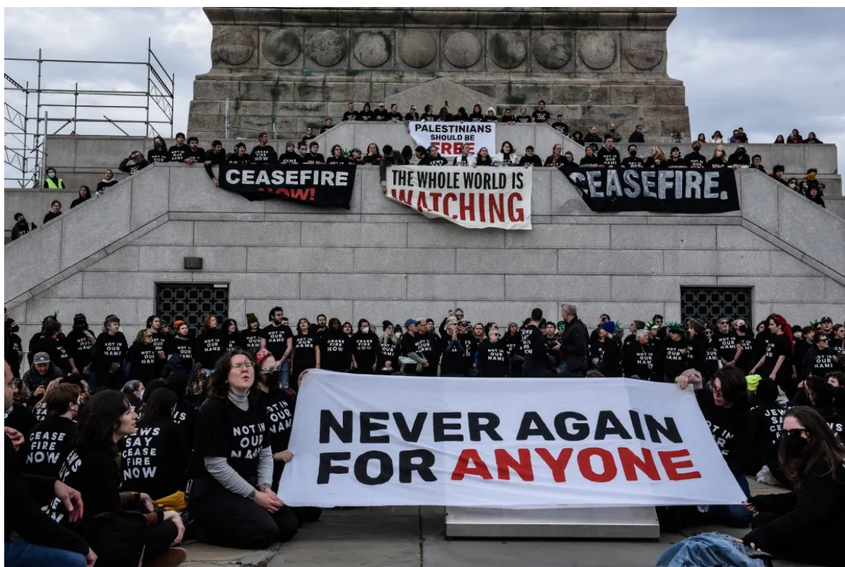
Activists occupy the pedestal of the Statue of Liberty on November 6, 2023 in New York City.