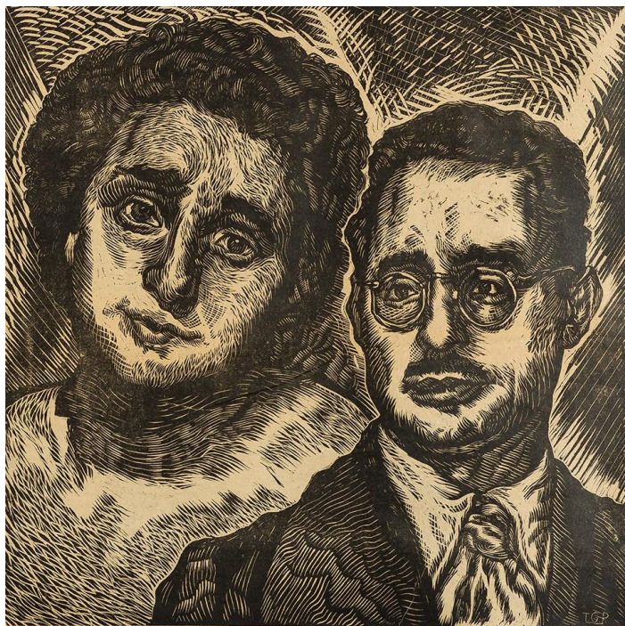
Ethel and Julius Rosenberg: from a woodcut poster issued by the Taller de Grafica Popular of Mexico.

The first time I saw the office I was taken