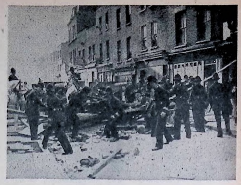
Barricades prevent passage of Mosley marchers.

It was obvious that the fascists and the police would now turn their attention to Cable Street. We were ready. The moment this became apparent, the signal was given to put up the barricades. We had prepared three spots.