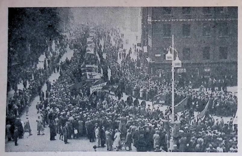
Communist anti-fascist demonstration through the East End of London in 1936.

well-provided premises, all these were paid for. The appeal was made to the worst elements, and the basest sentiments. Jews were "taking away your jobs." Because of the Jews "you had no home." The Jews were the bosses and the landlords. The capitalist Jew exploited you—the Communist Jew was out to take away your liberties, your freedom and your private property! It didn't make sense, but put over with flourish and showmanship, it was propaganda calculated to gull the more backward sections of the community. The B.U.F. won recruits, particularly from the younger elements in Shoreditch, Bethnal Green and Stepney. Jews were attacked every time when they were outnumbered or in no position to defend themselves, such as elderly people or children. Strife and tension characterized the atmosphere in East London in those years.